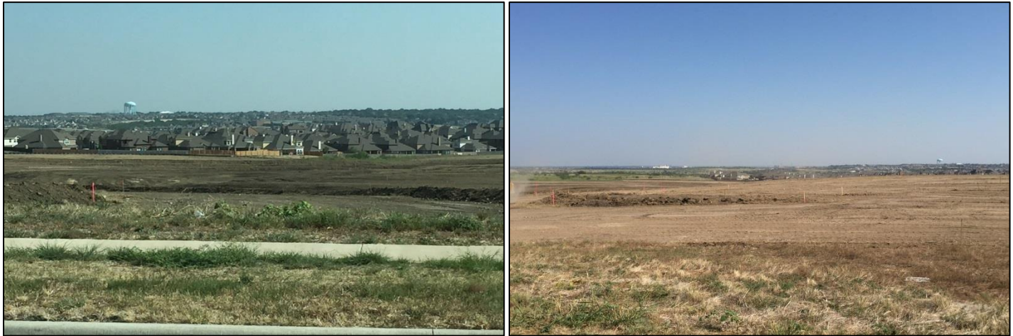
Chisholm Trail Ranch development

Crews have been moving earth in and around the Chisholm Trail Ranch development along the Chisholm Trail Parkway, including in and around the site of the future CISD elementary school #15.