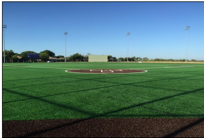
CHS baseball field