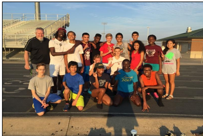
NCHS cross country team